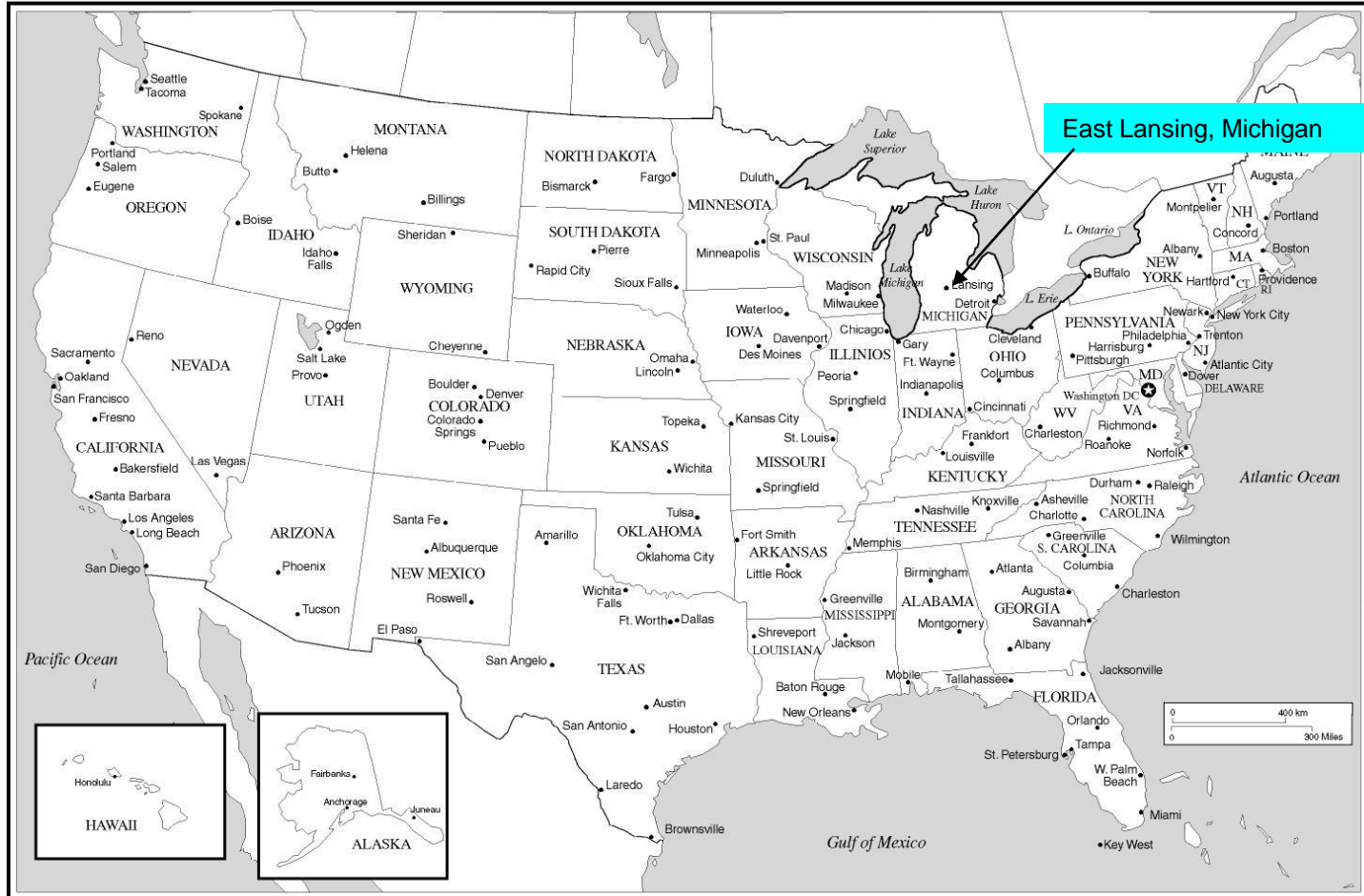
MAJOR U.S. CITIES

Produced by the Dept. of Geography The University of Alabama